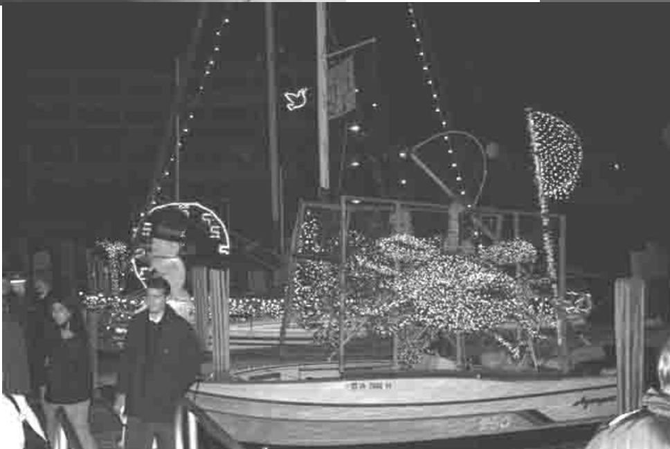
Even in black and white, these boats look festive.