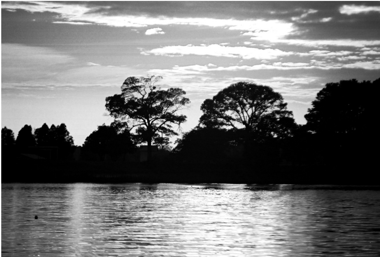
Sunset in Onancock Creek